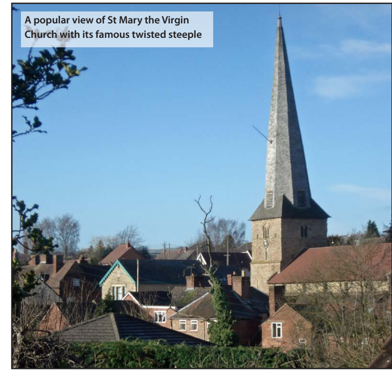
A popular view of St Mary the Virgin Church with its famous twisted steeple

For a walk description which focuses on the High Street please pick up the "Historic Town Trail" from the Visitor Information Point.