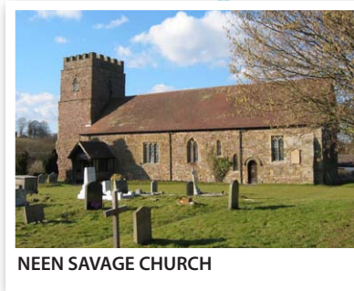
NEEN SAVAGE CHURCH